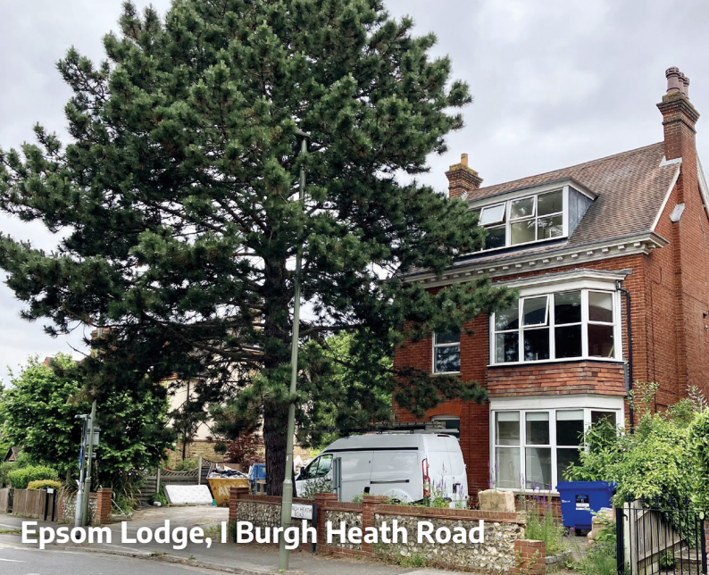
12 Burgh Heath Road, Epsom