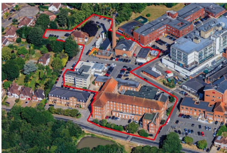
A nine-storey residential home by Guild Living on Woodcote Green Road will dominate the Chalk Lane and Woodcote and Millennium Green pond Conservation Areas.

Guild Living residential home, Epsom Hospital site, Woodcote Green Road (19/01722/FUL): Guild Living has now submitted a planning application for the land sold off by the NHS. The applicant has purchased the former nurses' home and hospital facilities at the rear of the main hospital site on Woodcote Green Road. The description is as follows: "Demolition of redundant hospital buildings and redevelopment of the site to provide a new care community for older people arranged in two buildings, comprising 302 to 308 care residences, 8 to 12 care apartments and 26 to 30 care