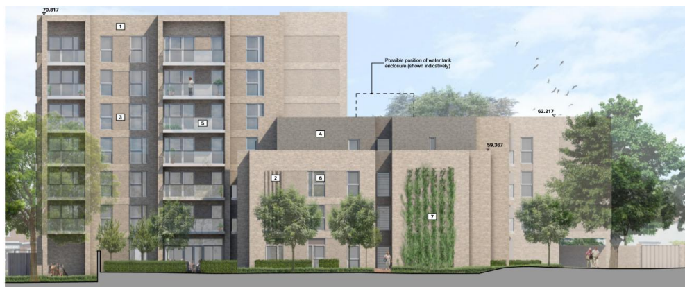
South-West elevation of the Police and Ambulance Station proposals on Church Street (McCarthy and Stone).

2/24 Dorking Road (19/01365/FUL): We reported in our Winter (No. 162) newsletter to members about this application for the demolition of two 1930s-era detached houses and their replacement with a new 3-4 storey building to accommodate 20 flats with basement parking. The Society's letter recommending refusal of the application is available on our website. As we go to press, the application is awaiting decision.