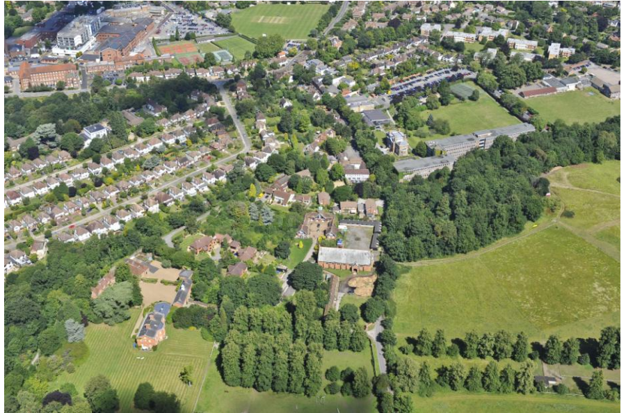
Aerial view showing the Atkins site and surrounding Green Belt and Chalk Lane Conservation Area.

While the amendments address several of our original concerns, we nonetheless concluded that the revised proposals constitute an attempt at significant over-development affecting heritage assets in one of Epsom's most important Conservation Areas, and accordingly we have submitted a second letter of objection which is available on the Society's website.