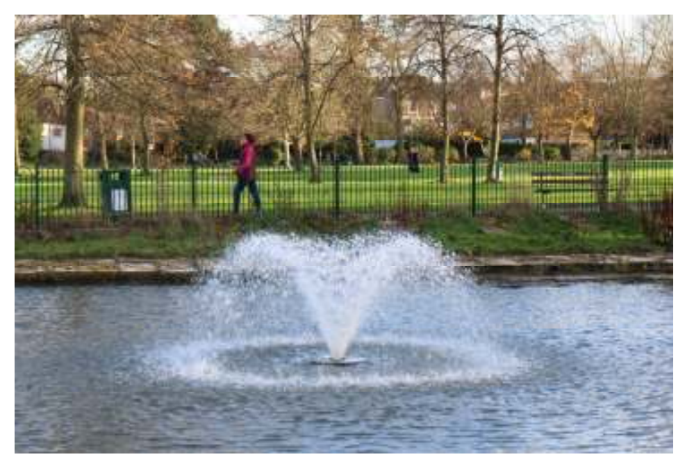
The new fountaim in Rosebery Park