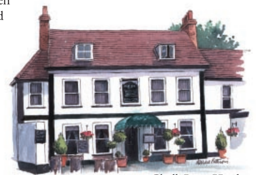
Chalk Lane Hotel

Prince of Wales, lived in the property between 1731 and 1747. This house was demolished and partly reconstructed, but during the rebuilding it was destroyed by fire. The house was finally rebuilt in 1764. Durdans was acquired in 1872 by Lord Rosebery, Prime Minister in 1894–95, and owner of Derby winners – Ladas (1894), Sir Visto (1895) and Cicero (1905). These three racehorses, along with Amato (1838), are buried in the grounds. The house was enlarged by Lord Rosebery but reduced back to more manageable size in