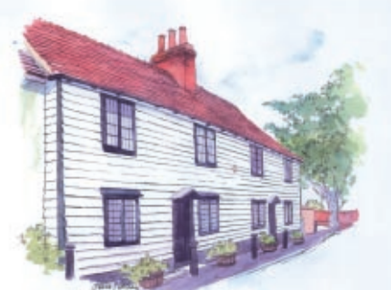
Chalk Lane Cottages

century timber framed barn while Nos 8 and 10 were a single house when first recorded in 1680. This group of cottages form a picturesque scene and they are much painted and photographed.