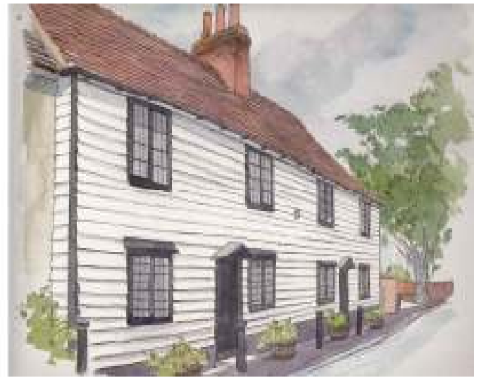
Chalk Lane Cottages