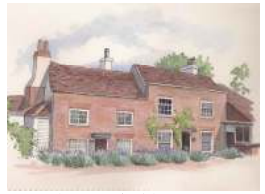
London House/ Paisley House