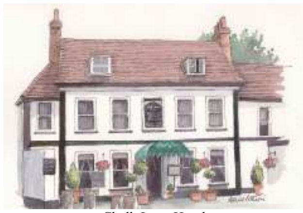
Chalk Lane Hotel